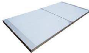
S/S hinged cover