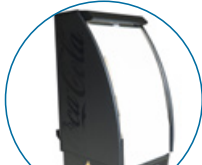
With night curtain