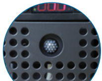
Sensor for illumination